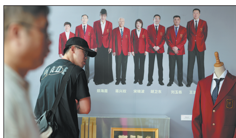
Visitors explore the basketball-themed exhibition at Dongguan Exhibition Center on Nov 12.

According to exhibition center staff member Wen Lei, the displays begin with the invention of basketball, its spread into China, and the rise of the professional game.