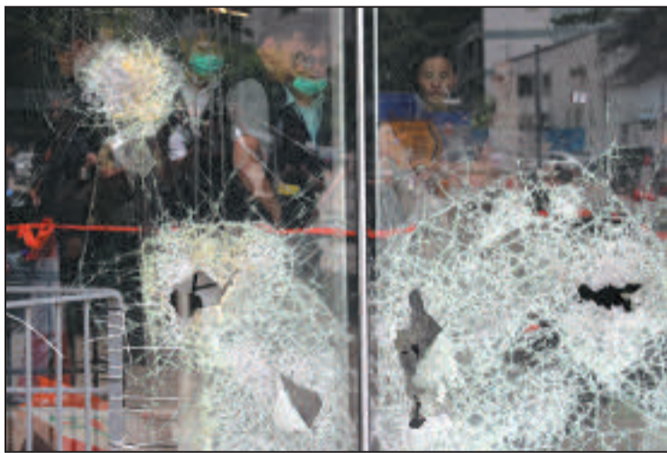
Glass doors stand shattered on Tuesday at Hong Kong's Legislative Council, a day after protesters broke into the building and temporarily occupied council chambers. Repairing the damage is estimated to cost HK$50 million.

The Legislative Council was attacked on the day Hong Kong was celebrating its return to the motherland 22 years ago, the statement said. It said the attackers trampled the city's rule of law, disrupted Hong Kong's social